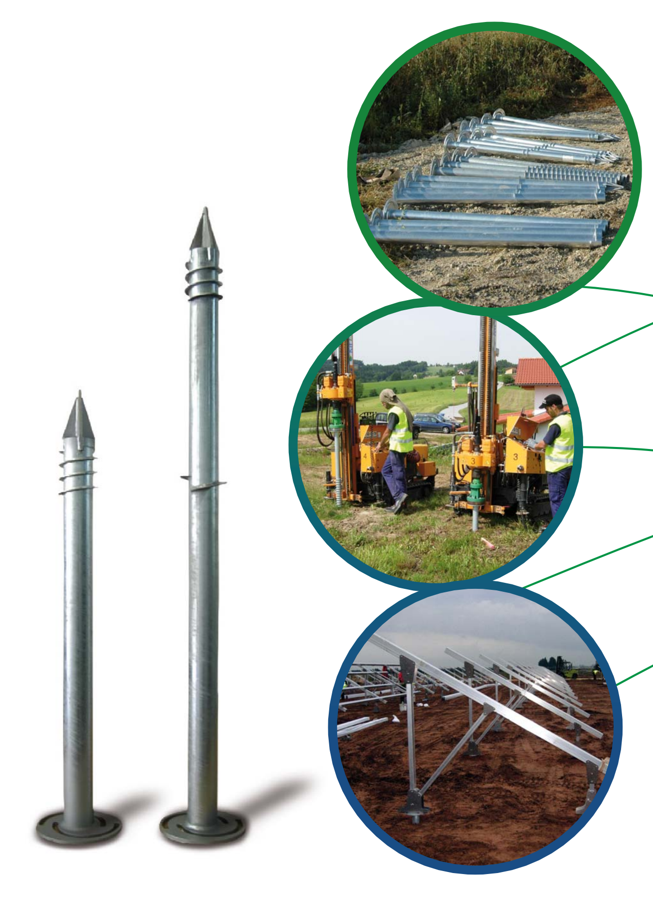
...providing the most efficient solutions.